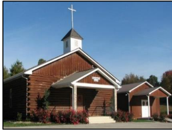
By vote of Messengers, Bible Baptist Church was received as a member church of the Sweetwater Baptist Association. We welcome this congregation to our