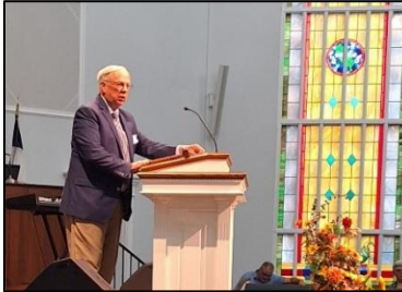
During his 14 th annual report to the Association of Churches, the Director of Missions shared of mission work at home, locally, across our state, country and around our world.